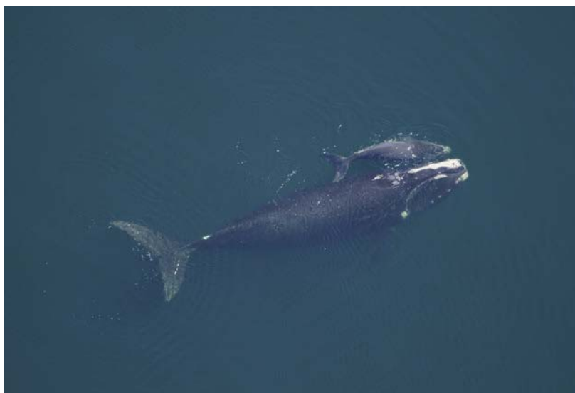
Image of a North Atlantic right whale mother and calf

66. Scientists estimate that approximately 400 North Atlantic right whales remain, with around 100 females capable of reproduction left in the population. Since April 2017, at least twenty right whale deaths have been reported, including at least nine females. In total, nearly 5 percent of the extant population is known to have died in the last two years. The world’s foremost right whale experts and NMFS’s own staff have publicly stated that the species is on the path towards extinction.